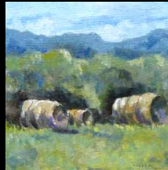
Oil painting by Bonny Sydnor selected for the Oatlands Miniature Show