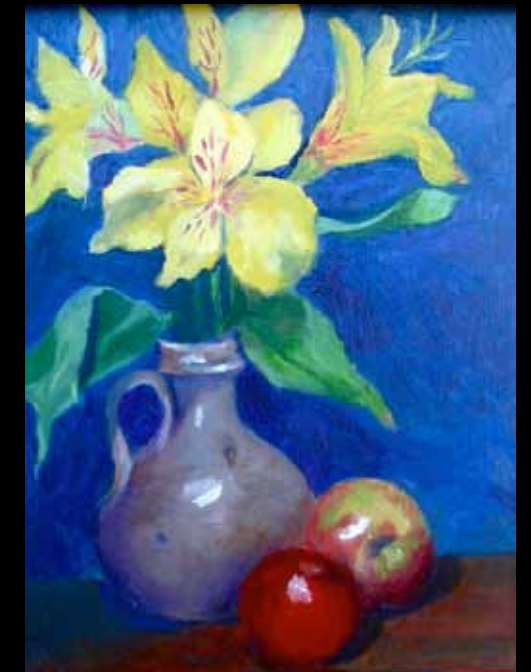
Oil painting by Sonia Gadra , will be displayed at the show, Local Color , at the Delaplaine Visual Arts Center