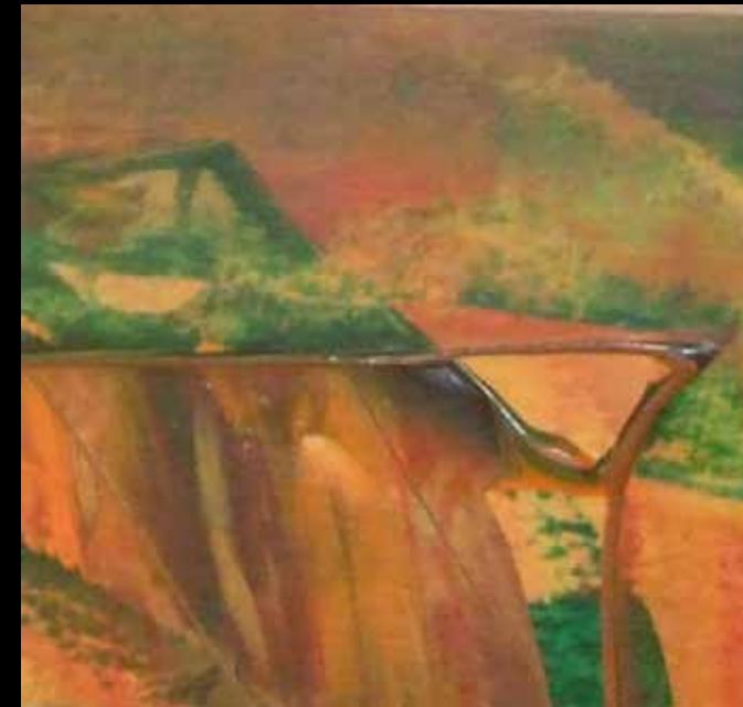
"Canyons", 4" x 4" acrylic on paper by Donna Ferrandino to be displayed at the Miniature Art Show in Sidney, MT