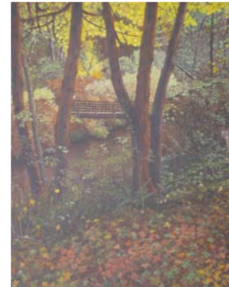
"A Bridge to Somewhere" by Gene Ganssle

I-70 to Exit 80, Rte. 32 North toward Sykesville. North 5.4 miles on Rte 32; left at Springfield Ave. traffic light. Right onto Third Street, Right into Fairhaven. Immediate right to parking.