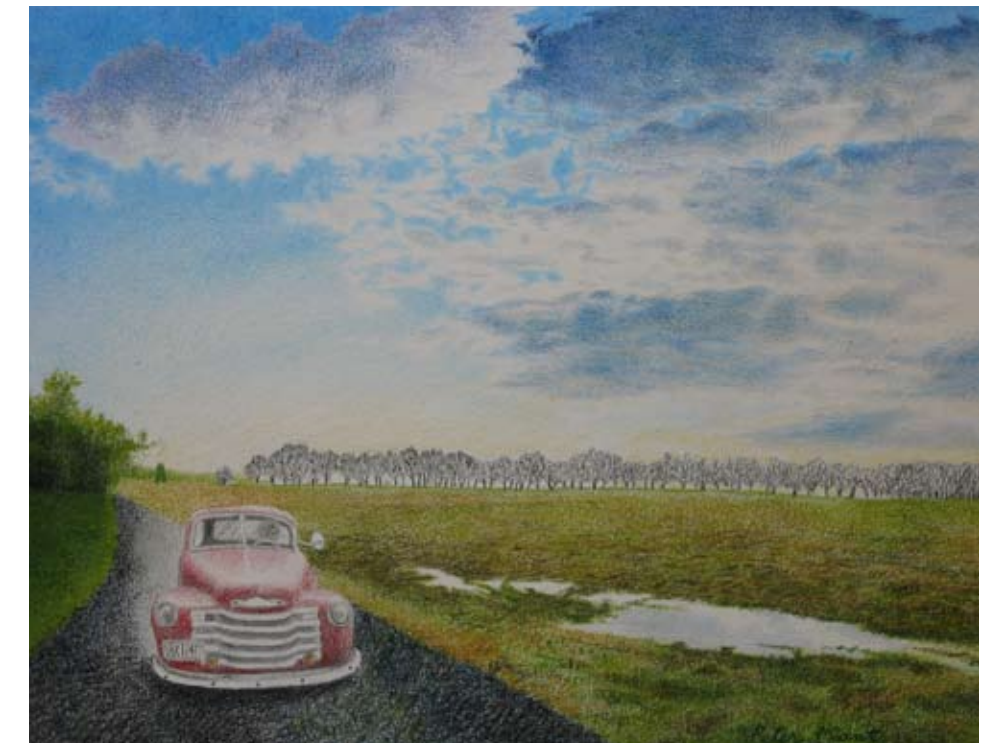
below: Peter Plant, Morning Commute-Side View.