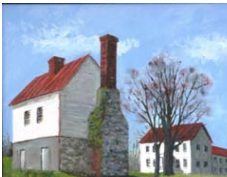
Best Farm , by Peter Plant

The public is invited join the artists during their opening reception on Sunday, May 2, 12:30 – 2:30, in the gallery located at 4880 Elmer Derr Road, in the Unitarian Universalist church. For further directions or weekday hours, usually 9 – 3, Tues – Fri, call the office (301-473-7680). The exhibit will be available until May 31.