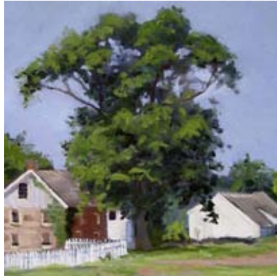
Tree at Weikert Farm