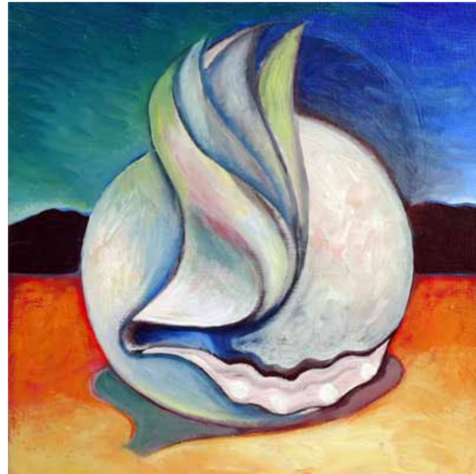
"Winged Hybrid" , 4" x 4" oil on panel, by Lisa Tarkett Reed