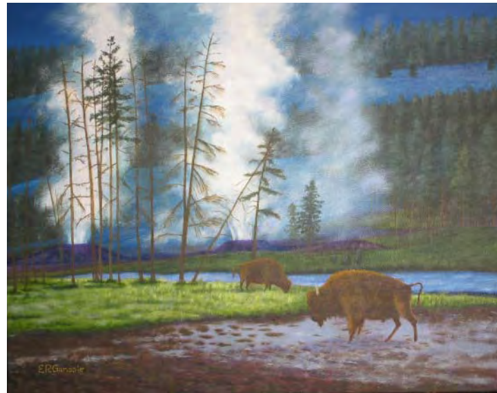
Yellowstone Icons , oil painting by Gene Ganssle