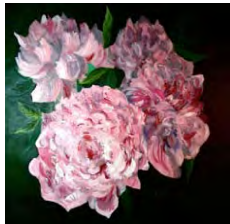
Peonies , oil painting by Sonia Gadra