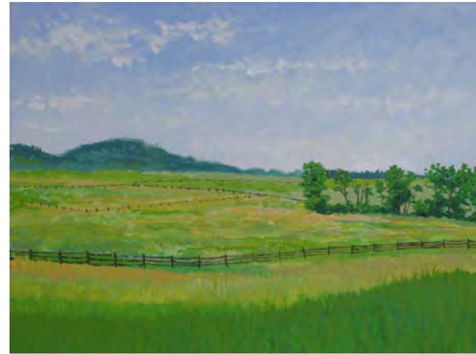
Big Round Top , by Peter Plant