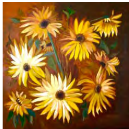
Sunflowers , oil painting by Sonia Gadra